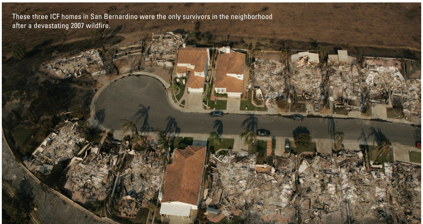
These three ICF homes in San Bernardino were the only survivors in the neighborhood after a devastating 2007 wildfire.

Contrary to popular belief, the foam used in ICFs will not burn. It will melt if exposed to high heat, but it will not contribute any fuel to the fire. In fact, it is virtually “self-extinguishing,” thanks to